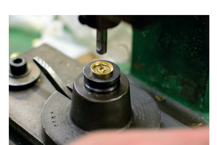
rom the second half of the seventeenth century, brass blazer buttons were produced for military and civilian wear.

Holland & Sherry brass blazer buttons are all handmade in England.